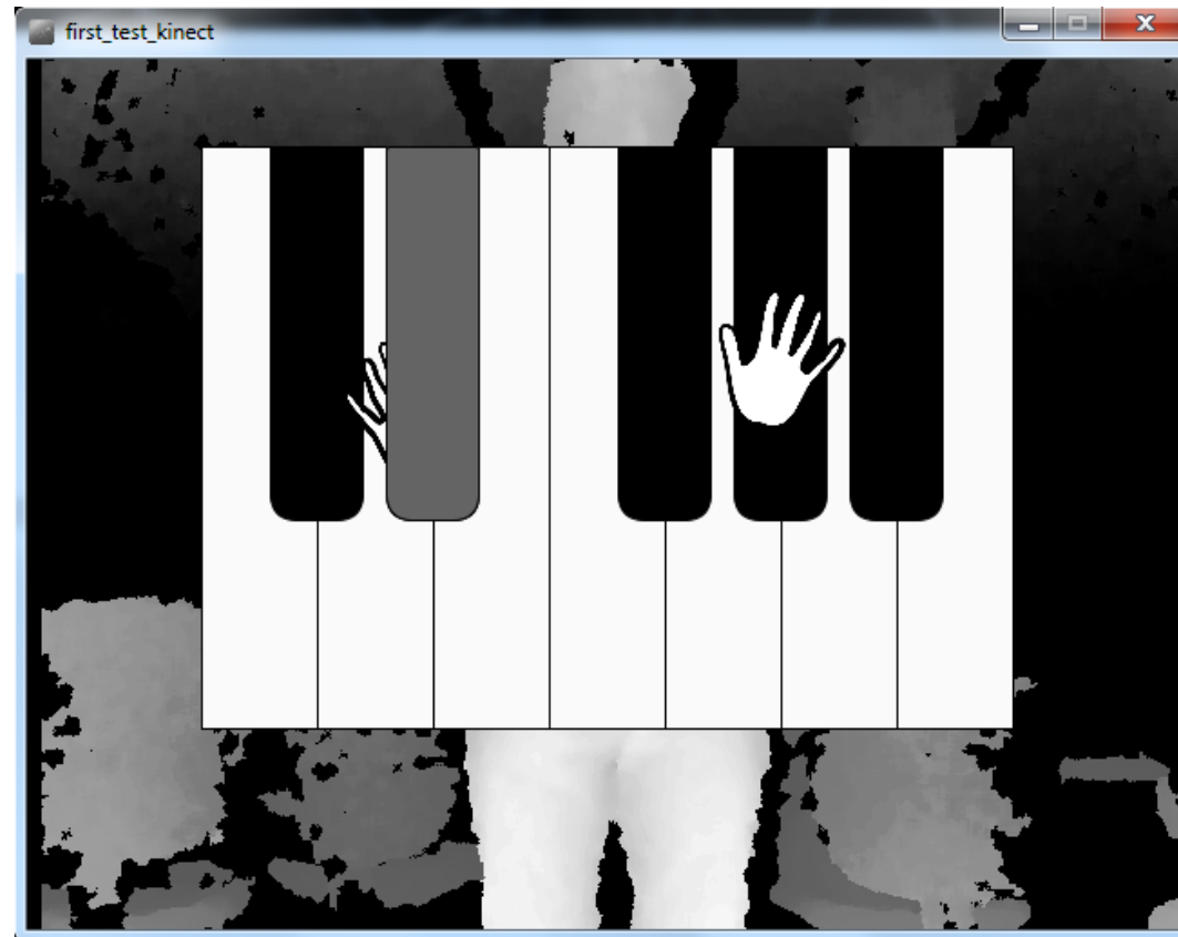
Basic View with gestures